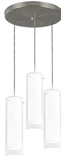
Clear Shade with White Glass

Specifications and dimensions subject to change without notice.